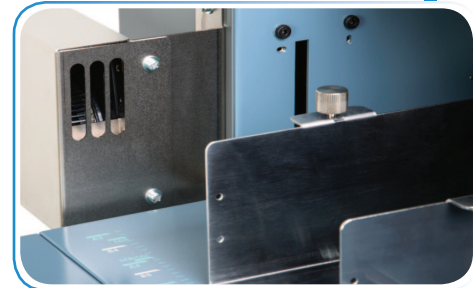
Optional Side Air Kit: Enhances feeding of heavy stock and large paper sizes