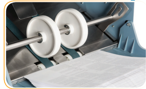
Outfeed Stacking Belt & Rollers: Automatically adjust to paper size. Two tray positions are available.