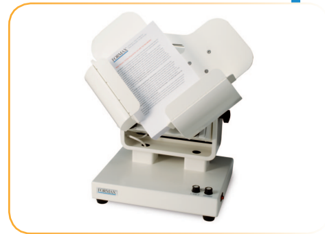
Optional FD 402TA1 Jogger: Air Jogger dries and reduces static electricity from forms and aligns them for proper feeding

Formax - New Hampshire, USA www.formax.com